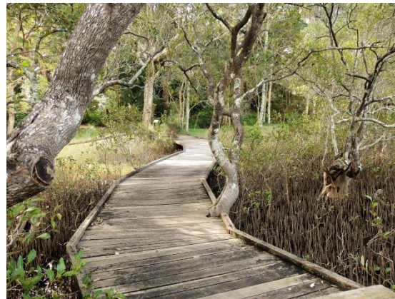
Mangrove board walk and creek walk

Walking paths and boardwalks allow for easy access. There is wheelchair access. (a wheelchair is available for use). A people mover is available by advance booking for a small charge.